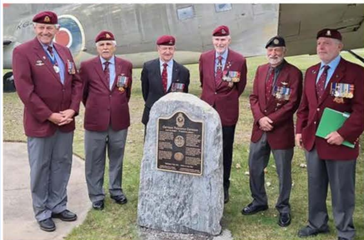
Photo: CAFA members at the unveiling of the Cyprus 1974 Memorial in CFB Petwawa on May 5th, 2024. Photo: CAFA members at the unveiling of the Cyprus 1974 Memorial in CFB Petwawa on May 5th,

Cyprus 2024 is the commemoration of Canada's contribution to peacekeeping in Cyprus on the 60 th anniversary of the UN mission, and the 50 th anniversary of a forgotten war. Most Canadians were unaware that, in 1974, Canadian troops were caught in the middle of a war between two NATO allies.