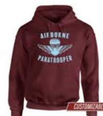
HOODIE W'WINGS & 'AIRBORNE PARATROOPER'