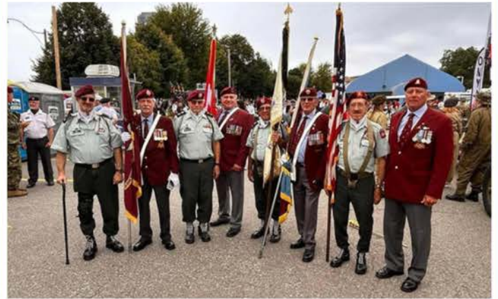
Members of CAFA and the US Airborne Association march in the Warriors Day Parade at the Canadian national Exhibition in Toronto on August 17th, 2024