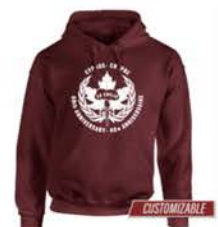
CYPRIUS 60TH HOODIE (LOGO IN WHITE)