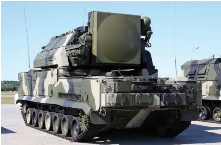
Figure 3.1 SA-15

Other larger, radar-guided SAMs have much longer range. The Russian-produced S-300/400-series (NATO designation SA-10/20/21) SAMs are much larger than the SA-15 and have ranges of up to 400 km, depending on the specific model of missile that is being fired. These large systems operate in multivehicle battery-sized units and require just a few minutes to emplace and prepare to fire, and they have a larger support “tail” than smaller systems, such as the SA-15.