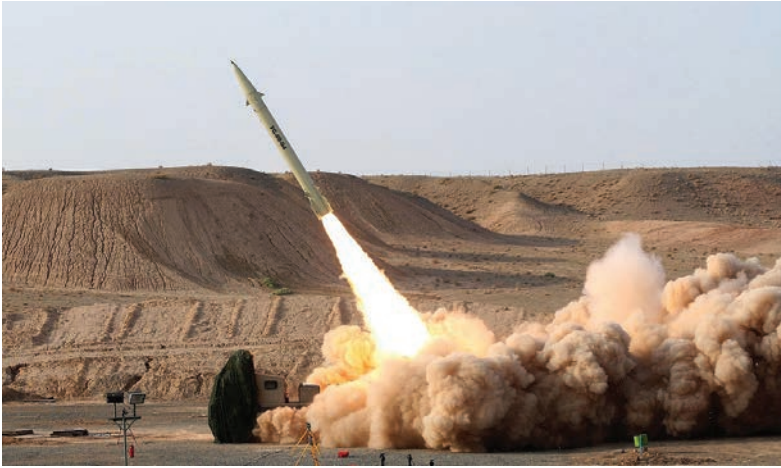
Figure 3.4 Fajr-5