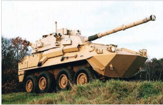
Figure A.3 LAV-AG