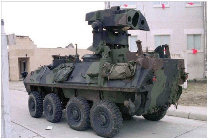
Figure A.4 LAV-AT