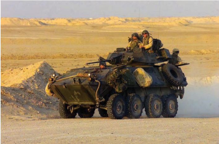
Figure A.1 LAV-25