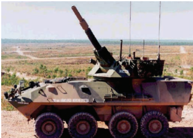
Figure A.5 LAV-M

The original LAV-M procured by the Marine Corps is fitted with an 81-mm mortar system that has a 360-degree traverse and can carry more than 90 rounds. The mortar is mounted in the center of the vehicle and fires through the three-part roof hatch. Newer versions, like the one shown in Figure A.5, included the 120-mm variant, which was purchased by the Saudi Arabian National Guard in 2009. This variant features a 120-mm NEMO (NEw MOrtar) system produced by Finnish Patria Land and Armament. The 120-mm NEMO turret has powered elevation and traverse and can be aimed, loaded, and fired while the crew is completely protected. Maximum range of the 120-mm NEMO mortar depends on the munition fired but is claimed to be around 10,000 m. 6