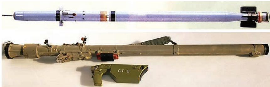
Figure 3.3 SA-18