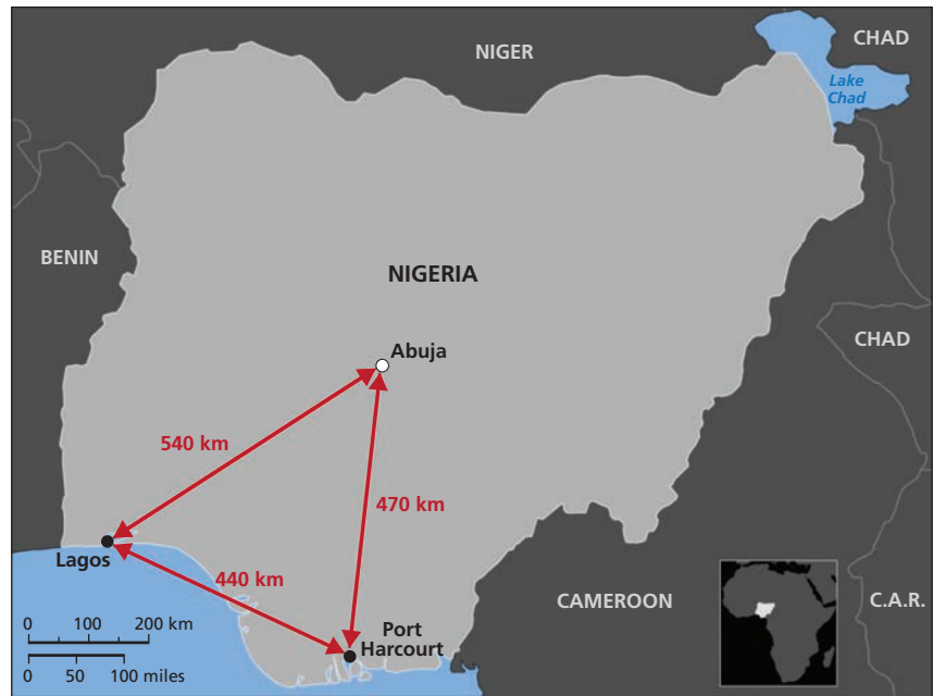
Figure 6.2 Nigeria

In such a scenario, both the strategic and tactical mobility of an airborne light armored infantry force would prove valuable. The