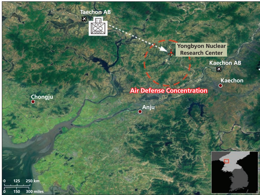
Figure 6.1 Yongbyon Concept