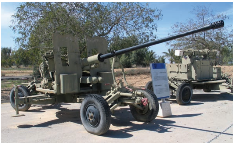
Figure 3.2 S-60 57-mm Anti-Aircraft Gun