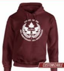
CYPRUS 68TH HOODIE (LOGO IN WHITE)

History Programme which has already included substantial Airborne items on our website for your reading pleasure. We have also already commenced the planning of a Battlefield Study to Europe for May 2027 tracing the footsteps of 1 Can Para Bn (more to follow on that in the near future.) And just this month we decided to examine a follow-up of the First Special Service Force (FSSF) and its outstanding feats of soldiering in Italy during the Second World War. And more Battlefield Studies are being considered, including some shorter, less expensive ones closer to home. We are also looking to help re-invigorate the various Airborne displays and archives in the Base Petawawa Museum with a view to potentially have some displays temporarily moved around some of the various locations in Canada.