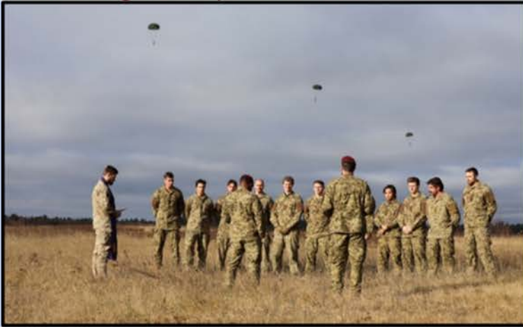
Soldiers Holding a Memorial Service for a Fallen Paratrooper on the Last Jump of a Basic Parachutist Course (November 2024)

This year Mike Company (M Coy) of the 3rd Battalion, The Royal Canadian Regiment (3 RCR) carried on the longstanding tradition of tactical excellence and outstanding leadership while executing complex training, leading parachute capability development and modernizing the Canadian Airborne identity. Highlights include: Ex PEGASUS HALO, exercising platoon command team battle procedure and enhancing parachute currency; Ex PEGASUS RAIDER, focused on developing M Coy's combat skills in urban environments; and Ex PEGASUS WHIRLWIND, familiarizing the troops with air assault SOPs.