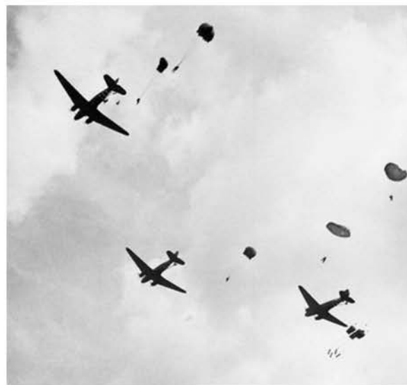
Photo: C-47 Dakota dropping paratroopers during WWII

Although the Second World War ended over eighty years ago, the conflict still remains in the consciousness of the world. The war has left a plethora of symbols, relics and reminders of that global struggle. No vestige of that conflict is more iconic, particularly for paratroopers, than the legendary C47 Skytrain aircraft, also known as the "Gooney Bird." It was a reliable, robust aircraft that became the workhorse, if not backbone, of Allied airborne and logistics operations. Throughout the conflict it served in every theatre including North Africa, Europe and the Far East.