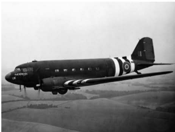
Photo: C-47 returning to the UK with wounded from Normandy July 1944.

Significantly, the CFB Petawawa Military Museum, as part of its Canadian Airborne Forces Collection outdoor display, proudly exhibits an original C47 aircraft. The airframe on display is Dakota Serial 42-92664. It served during the Second World War and continued its service well in the post war period. It was delivered to the U.S. Army Air Force on February 11, 1944. It was subsequently handed-over to the British Government on March 7, 1944 and assigned to 233 Squadron (Sqn), Royal Air Force (RAF), on 24 March 1944. RAF 233 Sqn participated in the three major airborne operations in Europe, namely D-Day, Operation Market