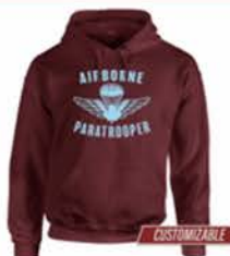
HOODIE W/WINGS & "AIRBORNE PARATROOPER"