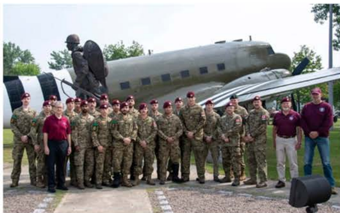
Photo: C-47 Dakota redidication with members of 3 RCR and CAFA

A ceremony was held on June 6 th , 2025, the 81st anniversary of D-Day, to rededicate the newly refurbished C-47 Dakota aircraft on display on the grounds of the Garrison Petawawa Military Museum.