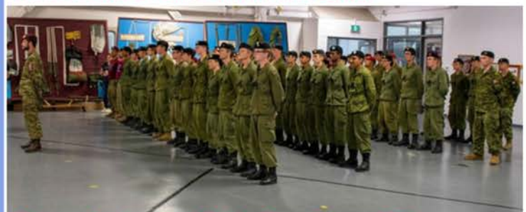
Photo: Graduates of Basic Para Course 253