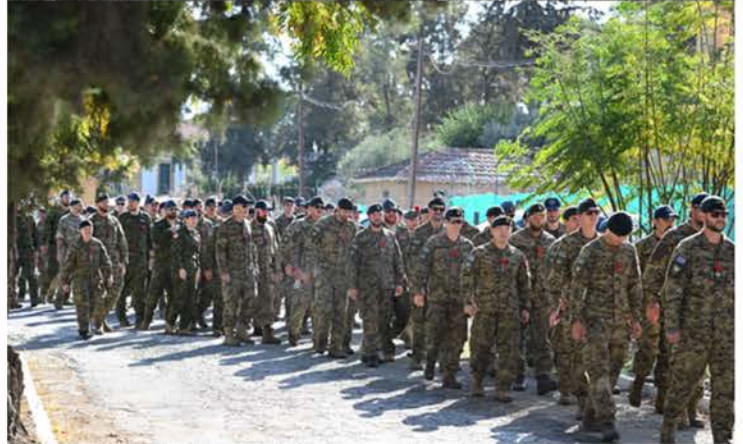
Photo: Canadian Troops in Cyprus past and present.