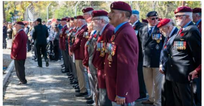
Picture: Members of the Cyprus 60 delegation on parade.

British, Finnish and Swedish Veterans, who were also marking their contributions to UNFICYP over 60 years, joined the Canadians. The British Veterans and spouses added their experiences from the 1974 defence of the Airport and events at Dhekelia sovereign area. The Finns shared stories of their evacuation, by Canadians, under fire from Kykko Camp. All activities were recorded and, along with the many video interviews, will form the basis of a documentary of Canadians in Cyprus.