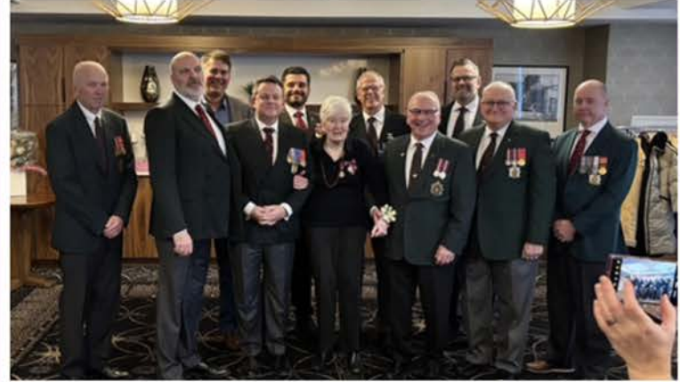
1 Can Para Association receives the KCM in Pickering