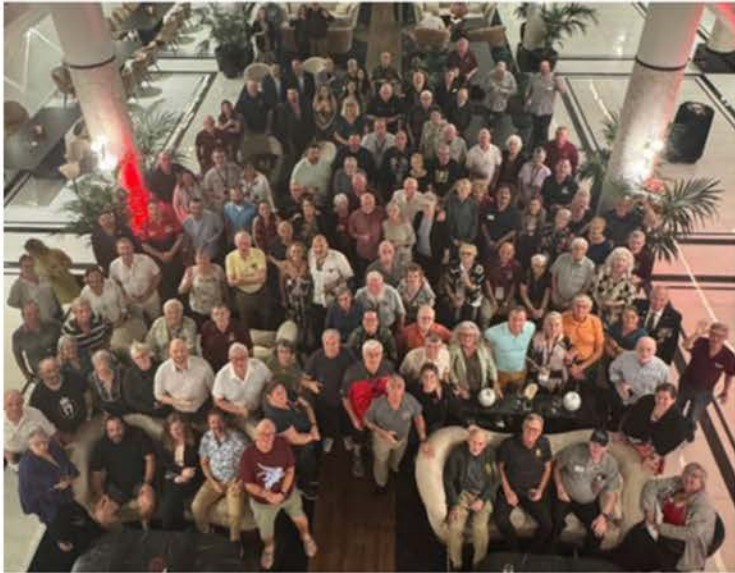
Photo: Members of the Canadian Cyprus 60 Contingent