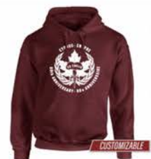
CYPRUS 80TH HOODIE (LOGO IN WHITE)