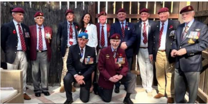
Photo: Members of the Cyprus 60 Executive with colleagues from the UK.