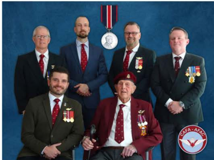
1 Can Para receives the KCM in Toronto