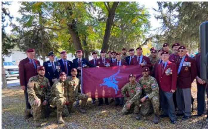
Members of 3 RCR take a moment to pose with UNFICYP Veterans