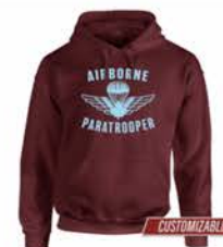
HOODIE W/WINGS & "AIRBORNE PARATROOPER"